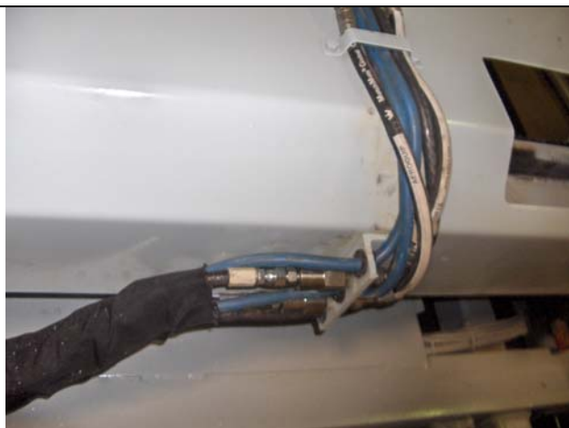
Hoses and cables installed within sleeving and routed between inner frame and I-Beam