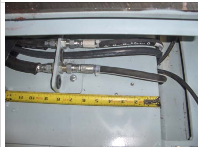
Hose bracket at inner frame top plate, centered on plate 8" from right edge of plate