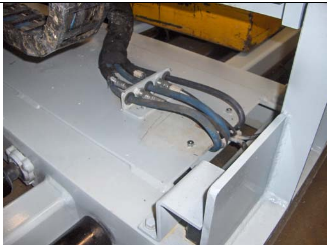
Hoses and cables installed within sleeving and routed between inner frame and I-Beam