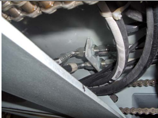
Bulkhead unions installed under roller deck