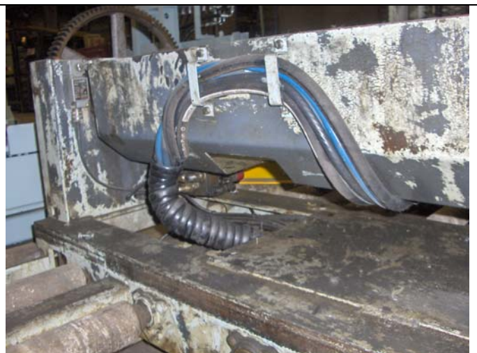
Original Hose routing