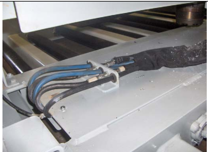
Hoses and cables installed within sleeving and routed between inner frame and I-Beam