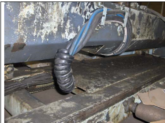
Original Hose routing