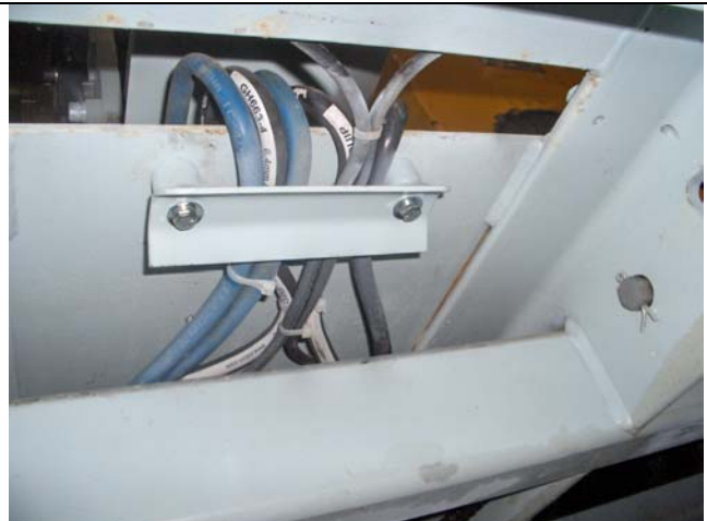
B806241 bracket installed on underside right edge of inner frame top plate, centered 1-1/4" from right edge