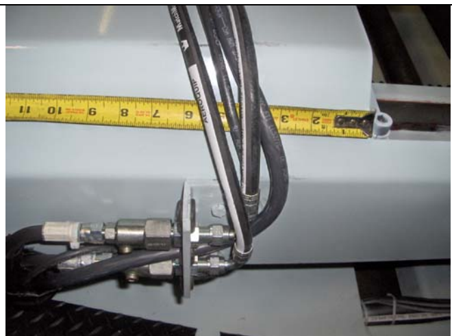
Hose bracket at I-Beam hose guard, centered on front bend 6" from right edge of trolley bearing access cutout