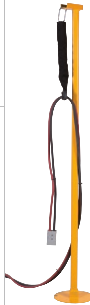
POGO POLE W/CHAIN & SUSPENDER-86" 808078A