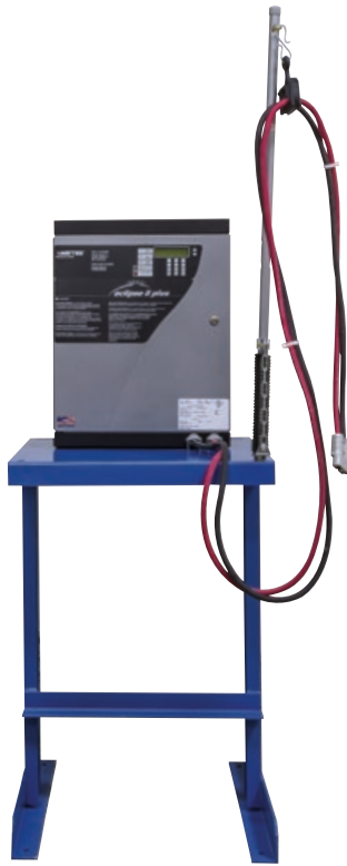
CSS24 STAND (Shown with 5079 - 40" Pogo Stick)