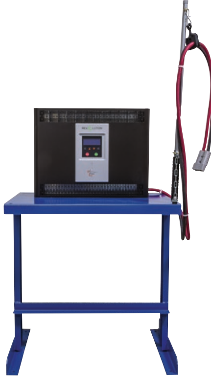
CSS36 STAND (Shown with 5079 - 40" Pogo Stick)