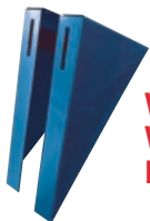
WCS-2 WALL MOUNT BRACKETS